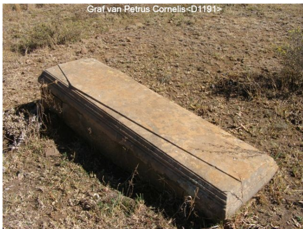
Graf van Petrus Cornelis-D1191>